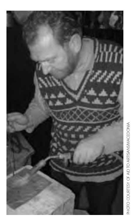
Client of Aid to Artisans Macedonia

Improvements to the enabling environment allow microentrepreneurs to participate in mar-