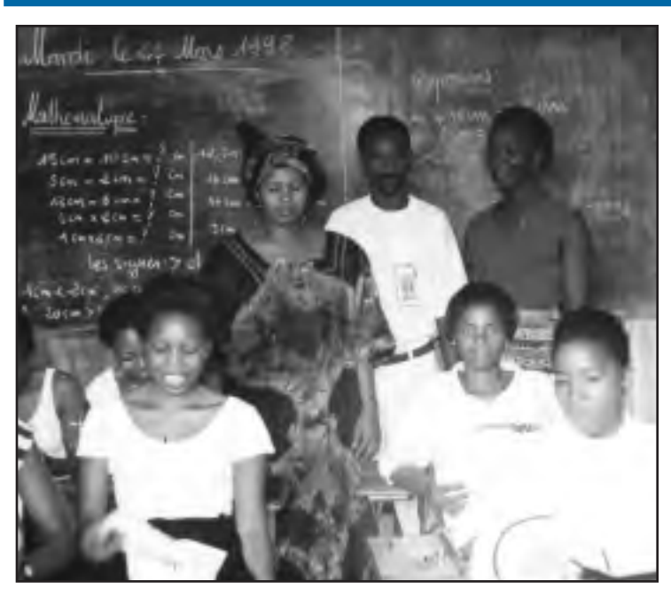
A PRIDE/Formation training class for micro-entrepreneurs.