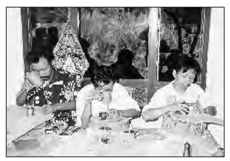
BRI Unit Desa customers making wayang or shadow puppets.