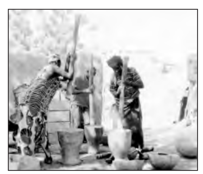
Millet Beaters in Mali

This year's annual report, "Reaching Down and Scaling Up: Into the Next Century," builds on the two primary themes for microenterprise development that were addressed in last year's report. Outreach to the poor and disadvantaged groups requires specific services and delivery techniques that have only