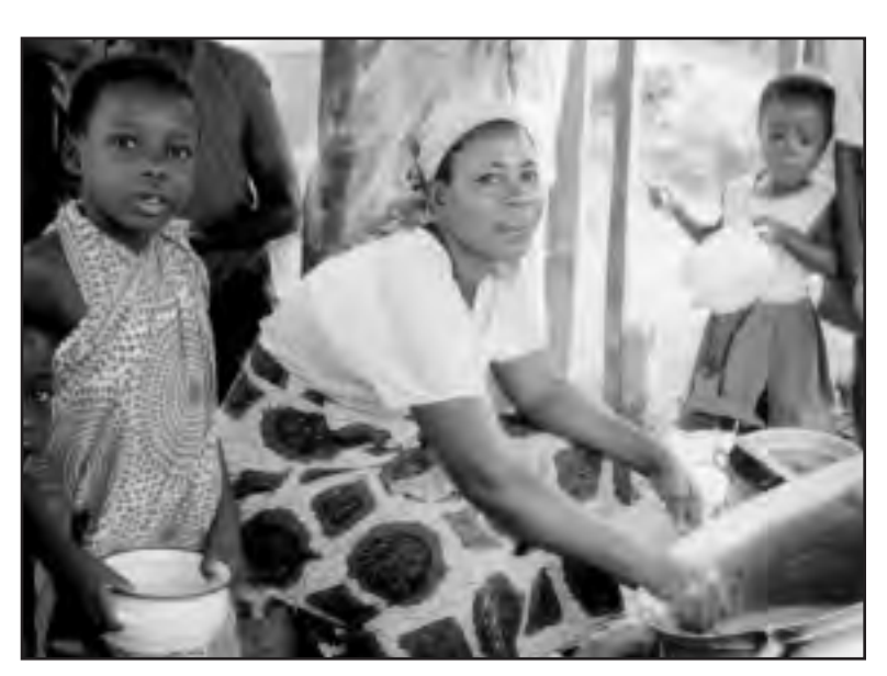
Rural bank member doling out maize porridge to local Gbanaian children.

CIS has offered its portable guarantee to three strong Latin American MFIs: PRODEM in Bolivia, FIE in Bolivia, and Banco Solidario in Ecuador. The loan capital obtained with the help of these guarantees was especially important to PRODEM and FIE which had already exhausted the collateral they had available for new bank loans. These guarantees represent a significant investment by each institution, which must pay fees for the guarantee in addition to loan fees for commercial bank funds.