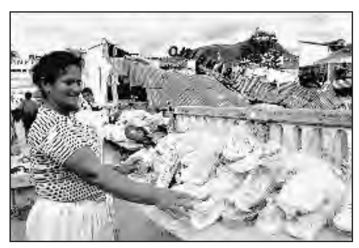
FINSOL client displaying ber wares after Hurricane Mitch.

Throughout the world, conflict has upended economies and created thousands of refugees. In these settings, local microentrepreneurs struggle to make ends meet for their families.