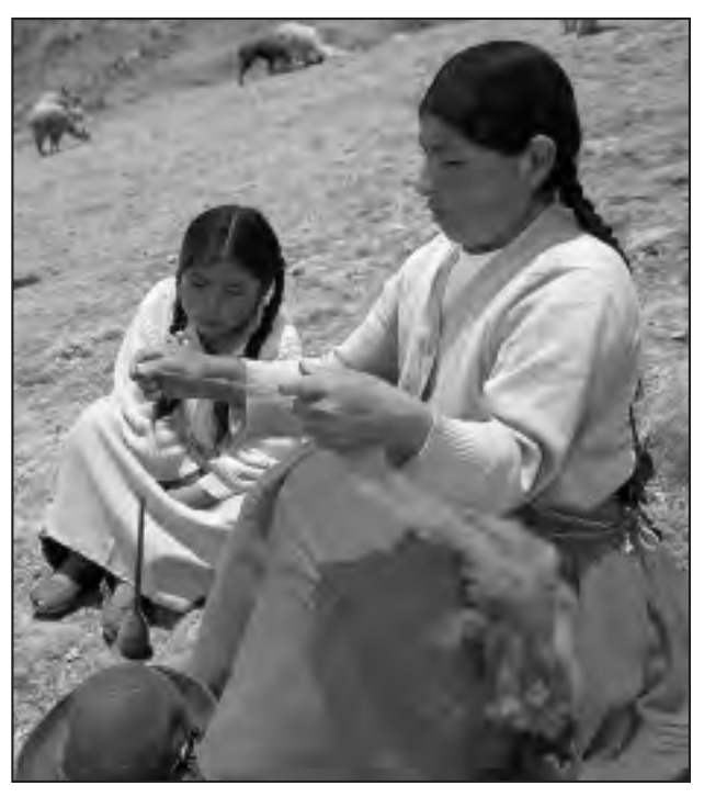
With the help of Heifer Project alpacas which produce a higher grade of wool, mothers in the Bolivian highlands give their daughters hope for a better future.

Over 80 countries have established baselines for poverty developed from income and consumption estimates. Yet these standards shed little light on the actual poverty conditions in which so many people live. USAID's AIMS Project<sup>6</sup> is actively engaged in the search for improved poverty measures and field-based analysis of the impact of microenterprise development programs on the poor. USAID has funded studies that have begun to build a database as a foundation for understanding how microenterprise assistance strategies affect the economic status of microenterprise clients. This database goes beyond traditional income determinants of economic status, which have proved difficult to measure, to focus on assets, risk, and vulnerability for microentrepreneurs. Assets, such as land, housing or equipment, for example, are extremely helpful to households during times of unexpected crisis. Assets are a source of liquidity and can be used as loan collateral.<sup>7</sup>