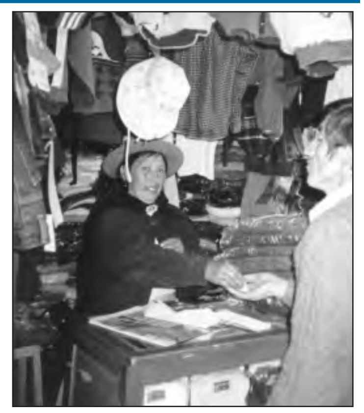
PROMUC vendor in Peru.

While poverty loans ($300 and less) are used as an indicator of a microfinance institution's service to the poor, there is not a single proxy for the poverty status of business development clients. However, 40 of the business service organizations reported 88 different programs supported by USAID in 1998 that are specifically designed to meet the needs of the poor. The programs include services such as counseling and dissemination of market information in rural areas, contract brokering in the garment industry, and business management training.